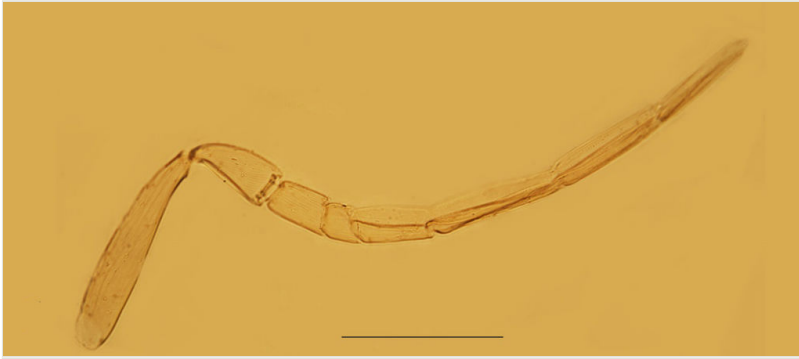
Figure 2. Pteroptrix orientalis , female: Antenna.