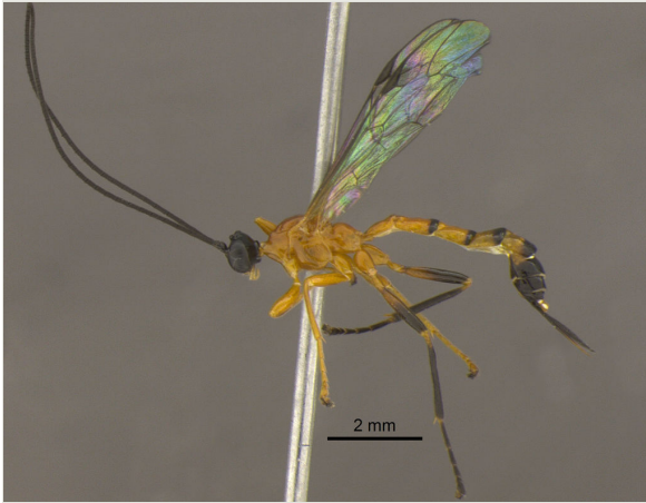
Figure 2. Adult female of Hymenoepimecis manauara .