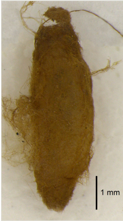
Figure 3. Cocoon of Hymenoepimecis manauara .