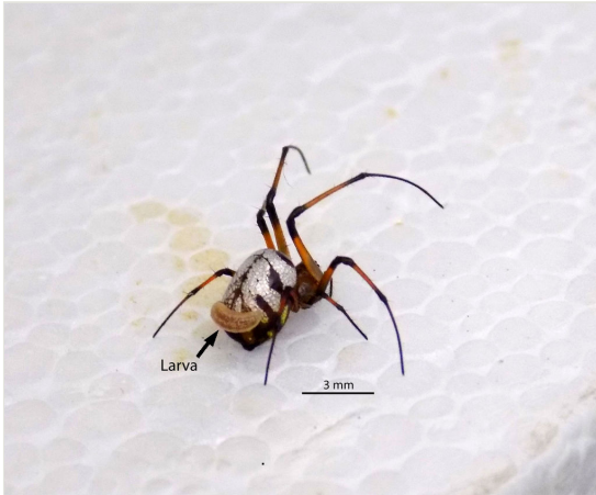
Figure 1. Adult female of Leucauge henryi containing a larva of Hymenoepimecis manauara attached on its abdomen.