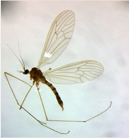
Figure 2. Trichocera annulata Meigen, 1818 female from Mallorca.