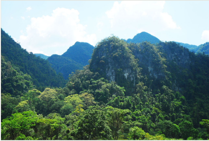
Figure 4. Moist limestone evergreen forest in LRR distribution area, PNKB NP, Vietnam.