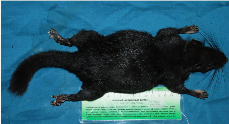
Figure 1. Dorsal view of the body of a Laotian Rock Rat Laonastes aenigmamus .