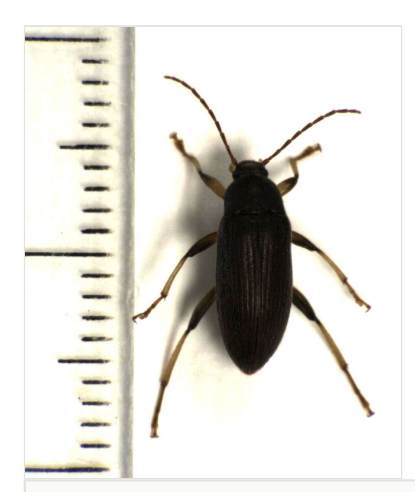
Figure 4. Homotrysis macleayi , from Tamaki Campus on 9 January 2014 (scale).