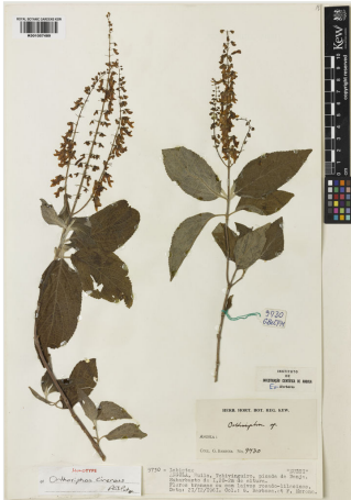
Figure 1. Holotype of Orthosiphon cinereus A.J.Paton.