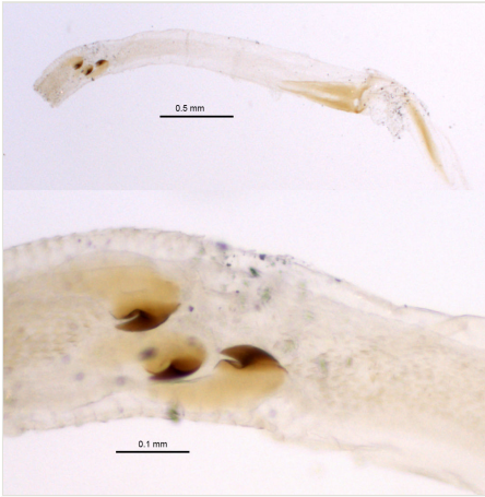
Figure 1. Madecorphnus niger Frolov, endophallus armature.