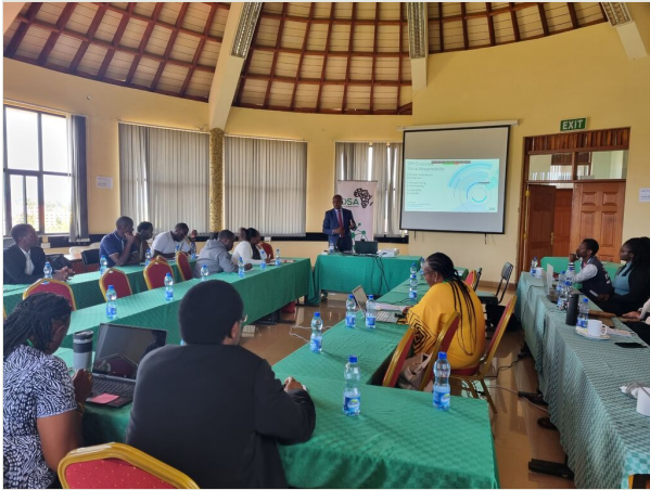
Figure 4. Mr. Matogo from IBM giving an overview of their digital learning platform.