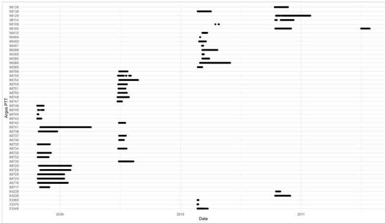
Figure 2. Deployment duration (x axis) for each of the deployed satellite tags (unique Argos PTT on the y axis). Deployments span 2009, 2010 and 2011. Satellite tags transmitted locations continuously (for example, 88741) or sometimes intermittently (for example, 88755).