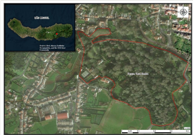
Figure 3. The location of Terra Nostra Garden in the area of Furnas in São Miguel Island.