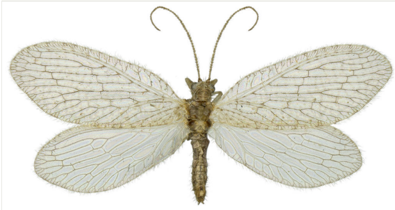
Figure 1. Micromus posticus (Walker): habitus dorsal view.