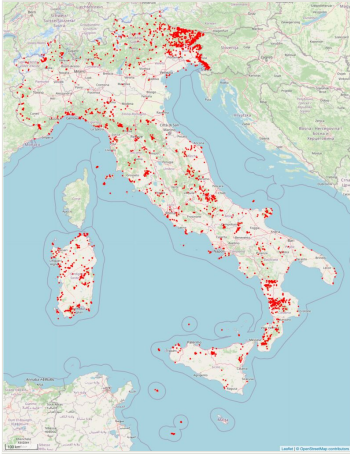
Figure 1. Distribution map of TSB herbarium specimens in Italy; created with Leaflet (Agafonkin 2022).