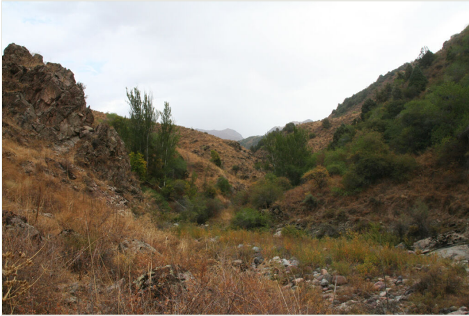
Figure 1. Sampling site landscape in Chatkal NR.