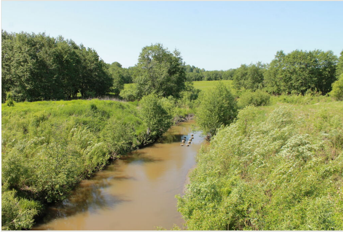
Figure 2. Habitat of M. griseola – Bobrovka River.