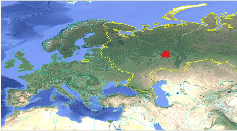
Figure 3. The position of the Udmurt Republic (red area) relatively to Russia (yellow borders) and other countries (cyan borders).