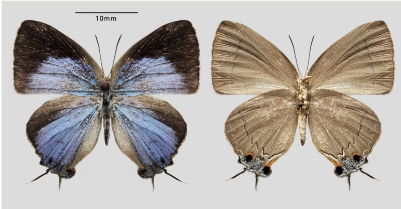
Figure 5. Tajuria sekii sisyphus ssp. nov., (Paratype, female).