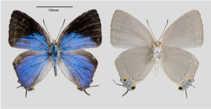
Figure 3. Tajuria sekii sisyphus ssp. nov., (Holotype, male).