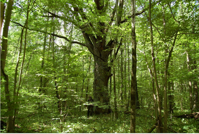
Figure 3. The old-growth broad-leaved subclimax forest site.