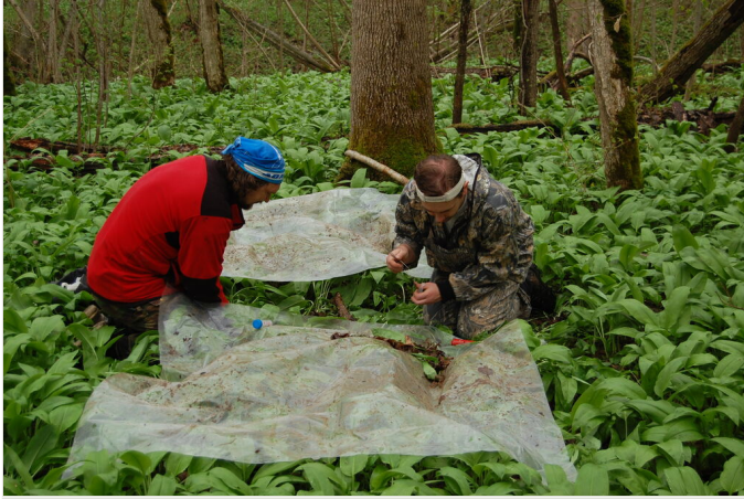
Figure 5. Earthworms hand-sorting in old-growth forest site.