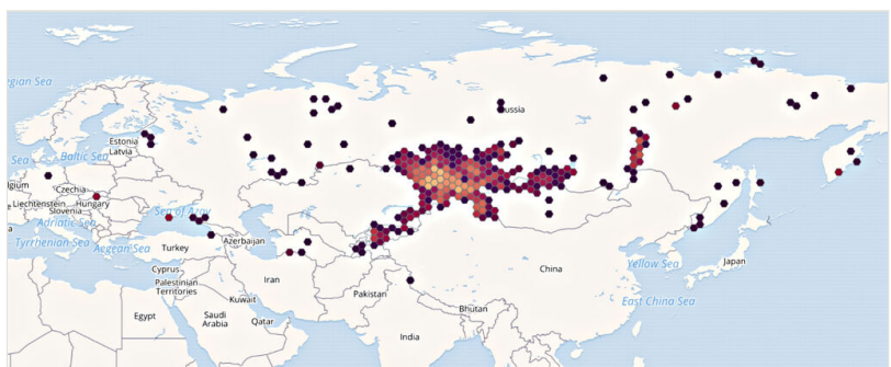
Figure 2. Geographic coverage of occurrences with precise coordinates digital collection ALT B (Virtual Herbarium ALT B (South-Siberian Botanical Garden) (GBIF.org, accessed on 30.03.2021).