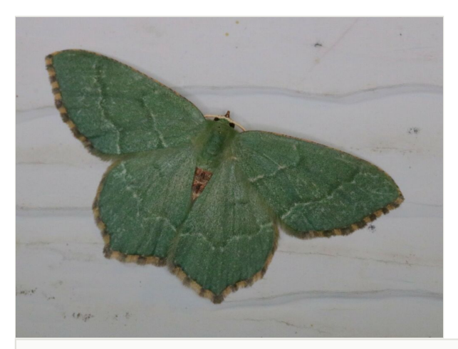
Figure 1. *Hemithea aestivaria* photographed in Saint-Augustin-de-Desmaures, Québec, on 30 June 2020.