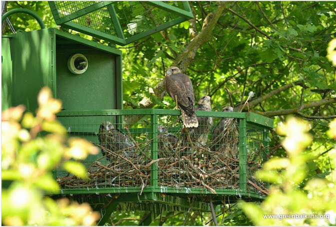
Figure 2. Photograph of an opened hack cage