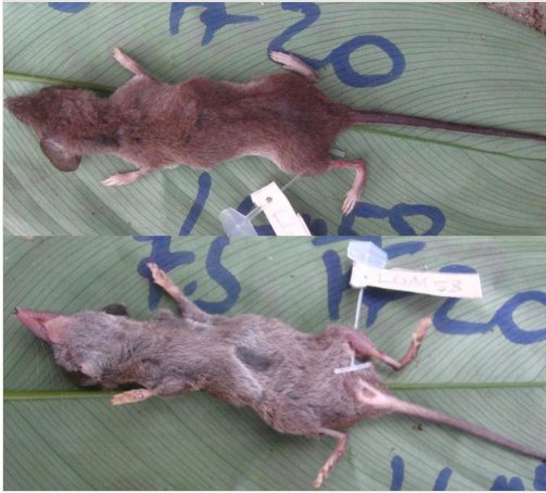
Figure 2. Dorsal and ventral view of Crocidura sp1 yoko (LEGM458, Mukinzi 2014).