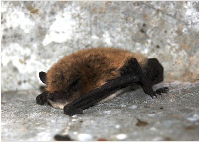
Figure 1. David's myotis from Yenisei river.