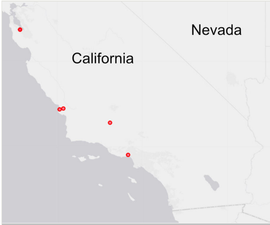
Figure 6. Distribution of M. simunorum new species in California.