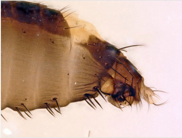
Figure 3. Megaselia simunorum new species, male, abdomen lateral.