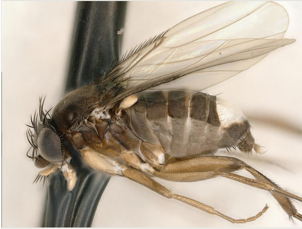
Figure 1. Megaselia sinumorum new species, male, lateral.