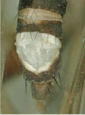
Figure 2. Megaselia simunorum new species, male abdomen, dorsal.