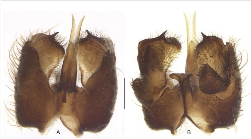
Figure 2. Ditomyia macroptera Winnertz, male terminalia: dorsal view (A), ventral view (B). Scale bar 0.2 mm.