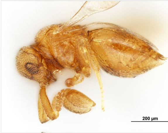
Figure 2. Brightfield image showing the lateral habitus of Pteroceraphron mirabilipennis Dessart 1981.