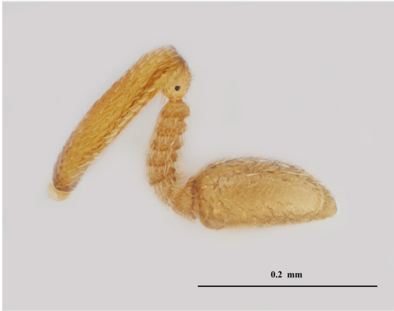
Figure 3. Brightfield image showing the female antenna of Pteroceraphron mirabilipennis Dessart 1981.