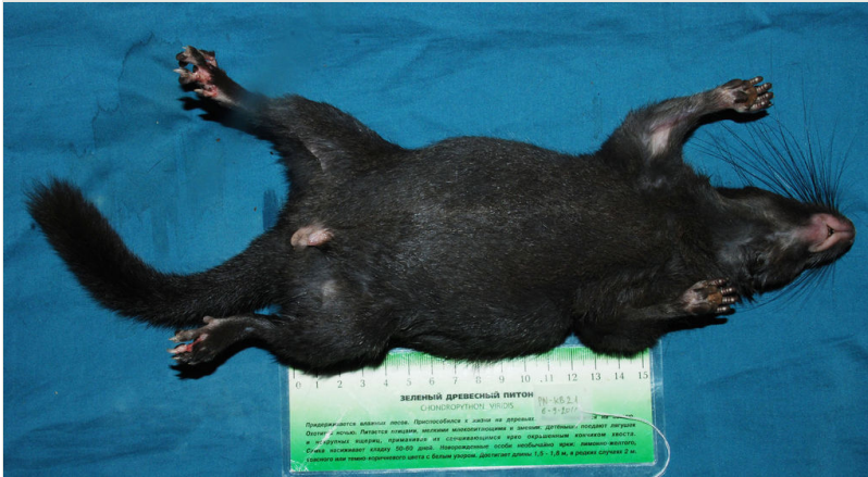
Figure 2. Ventral view of the body of a Laotian Rock Rat Laonastes aenigmamus .