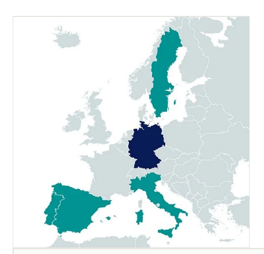
Figure 3. Map of the countries involved in RIPARIANET.