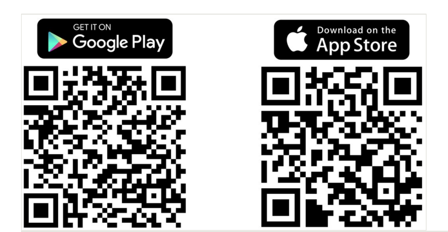
Figure 2. QR Codes to download the application.