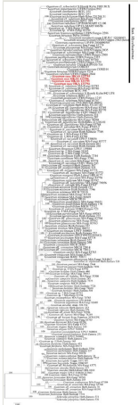
Figure 2. Phylogenetic tree of Geastrum species and related taxa, based on ITS and nrLSU sequence data.