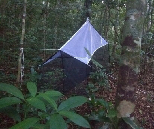
Figure 2. Typical Malaise trap in the Atlantic Forest.