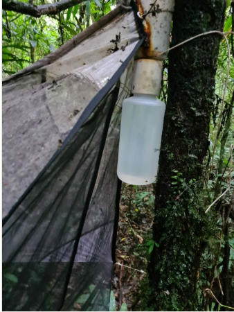
Figure 3. Ethanol > 90% recipient to preserved specimens from our fieldwork.