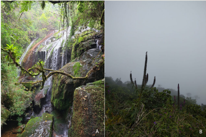
Figure 4. The Brazilian Atlantic Forest - (A) Cachoeira do Papel - Trilha da Pedra do Sino, Teresópolis, Rio de Janeiro - Brazil (B) Mirante - Trilha da Pedra do Sino, Teresópolis, Rio de Janeiro - Brazil.