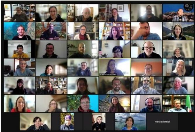
Figure 1. Screenshot from one of the Workshop plenary sessions.