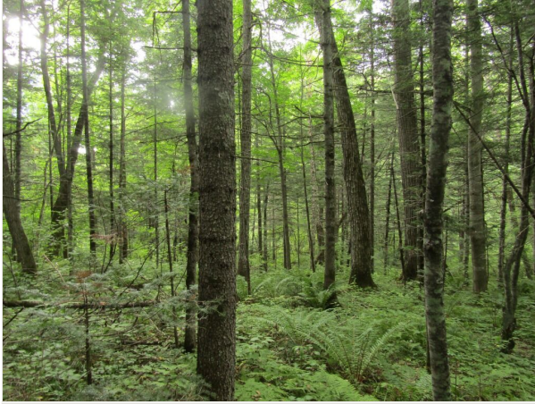
Figure 8. Valley mixed forest (plot "Chuguev"), photo by A. Geras'kina.