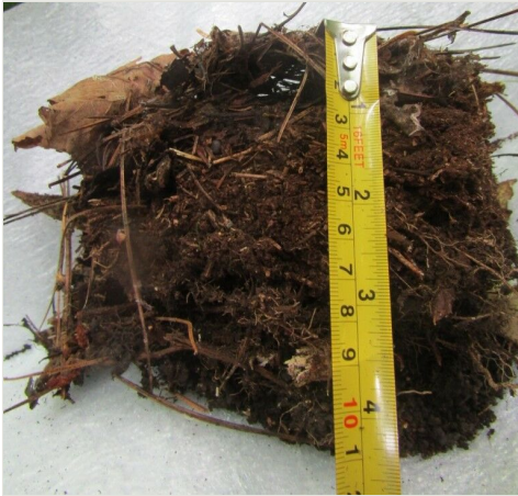
Figure 9. Litter in plot "Chuguev", photo by A. Geras'kina.