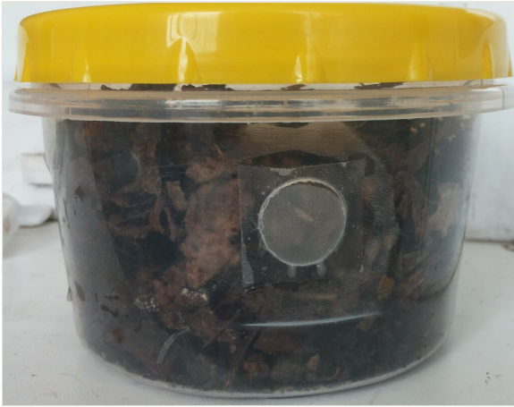
Figure 2. One plastic container with a core