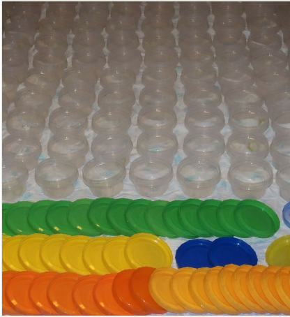
Figure 1. Plastic containers