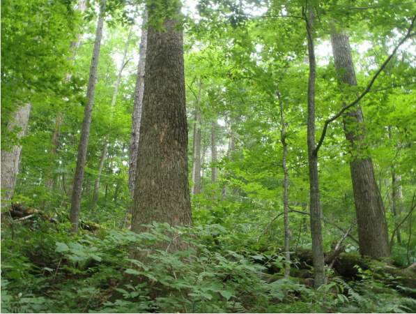
Figure 5. Mountain fir–hornbeam forest in Ussuriiskii natural reserve (plot “Grabovaya”), photo by N. Kuznetsova.