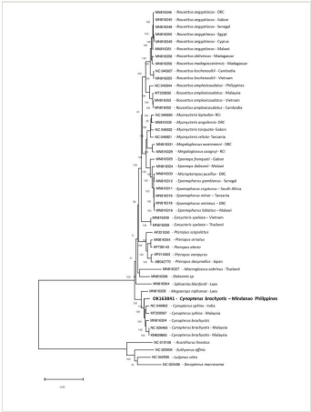
Figure 2. Maximum Likelihood phylogeny of selected fruit bat mitogenomes obtained from GenBank. The tree was generated using MEGA 7 with 1000 bootstrap replicates. The DNA substitution model used was GTR+G+I. The scale bar denotes the number of substitutions per site which is reflected in the branch lengths (i.e. 0.5 value means 5 nucleotide changes for every 10 nucleotides). Bootstrap values for clade support are written on the nodes of the branches. An outgroup consisting of fish mitogenomes was included in the phylogenetic tree inference.