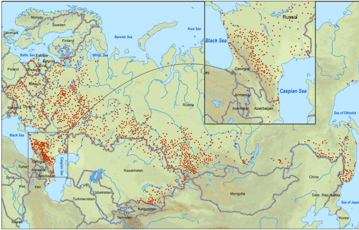
Figure 3. Occurrence records of Apodemus agrarius in the former USSR.