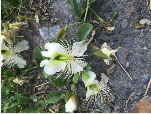
Figure 3. Possible larval food plant, Capparis himalayensis , found in Diya Township.