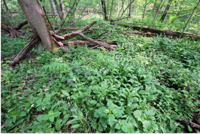
Figure 3. Broad-leaved forest in the "Kaluzhskie Zaseki" Nature Reserve.