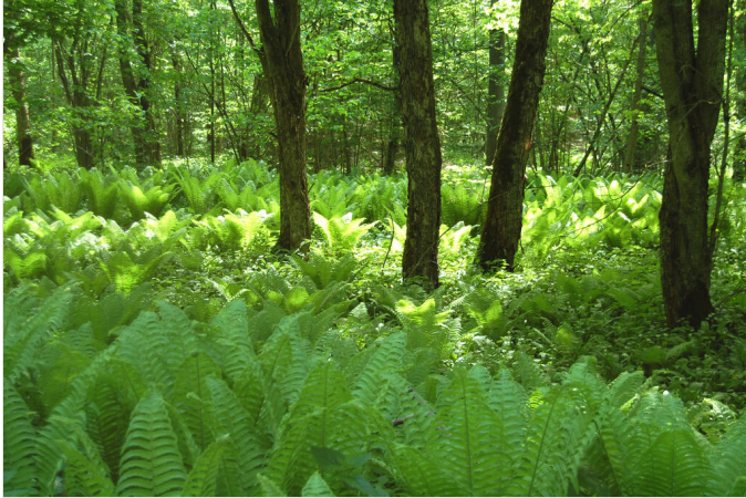
Figure 4. Broad-leaved forest in the Ugra National Park.