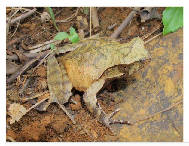
Figure 5. Megophrys jingdongensis ( TBU ML.2017.9, adult female) from Son La Province, Vietnam.