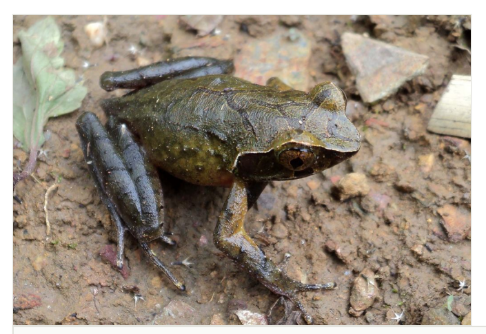
Figure 7. Megophrys parva (TBU PAE.705, adult male) from Son La Province, Vietnam.