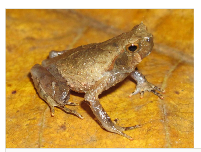
Figure 6. Megophrys microstoma (TBU SL.2016.419, adult male) from Son La Province, Vietnam.