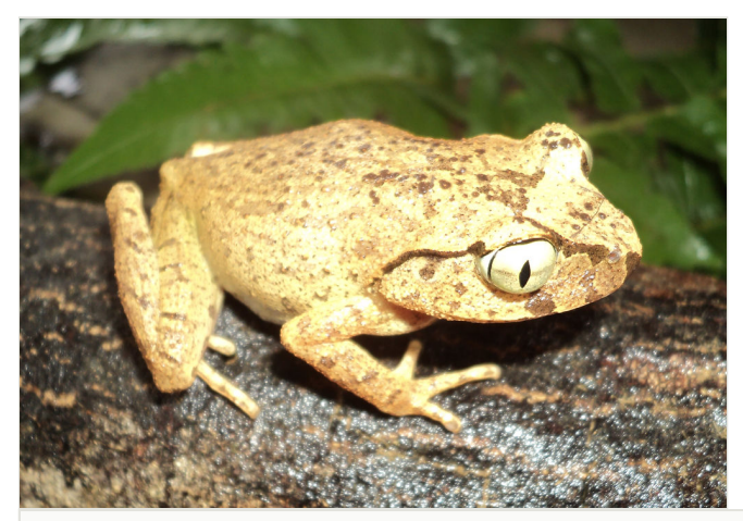
Figure 3. \textit{Leptobrachella sungi} \ (\text{TBU MD.2015.116}, \ \text{adult female}) \ \text{from Son La Province}, \ \text{Vietnam}.