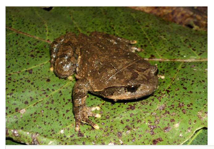
Figure 4. Megophrys feae (TBU MD.2015.174, adult male) from Son La Province, Vietnam.