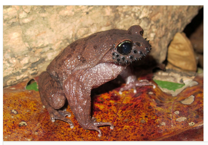
Figure 2. Leptobrachium ailaonicum (TBU ML.2017.9, adult male) from Son La Province, Vietnam.