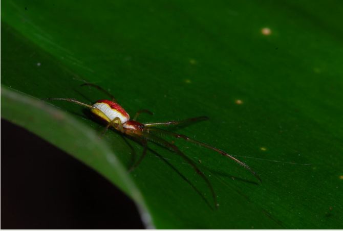
Figure 4. Sancus acoreensis (Wunderlich, 1992).