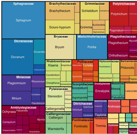
Figure 2. Taxonomic distribution of species amongst moss families in the dataset. The figure was prepared with the “treemap” package in R (Tennekes 2017)