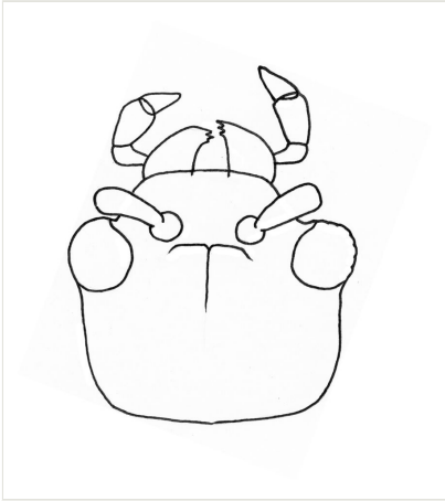
Figure 3. Clavicornaltica belalongensis n. sp., head, female (holotype, UBDM.3.01171).