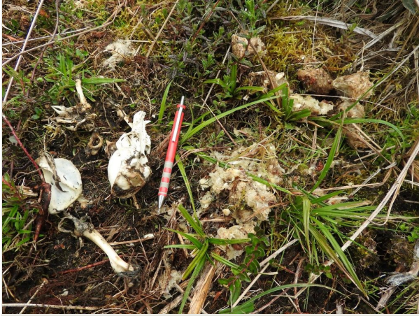
Figure 2. Nasuella olivacea bones near bear faeces.