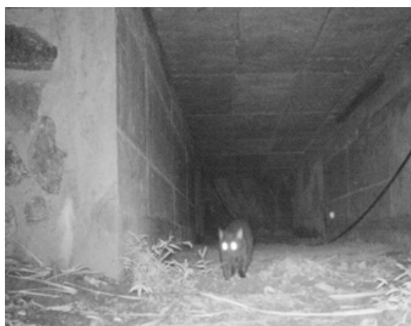
Appendix C Image 7: Domestic Cat ( Felis catus ) pictured in Tunnel 2