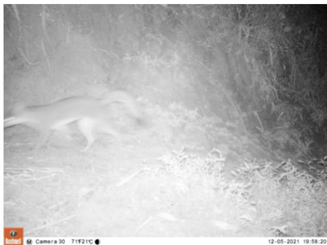
Appendix C Image 12: Gray Fox ( Urocyon cinereoargenteus ) pictured in fragment.