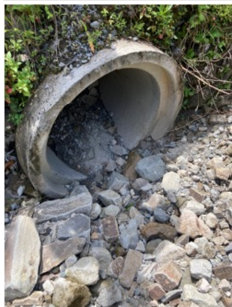
Appendix A Image 8: Entrance of culvert 2.