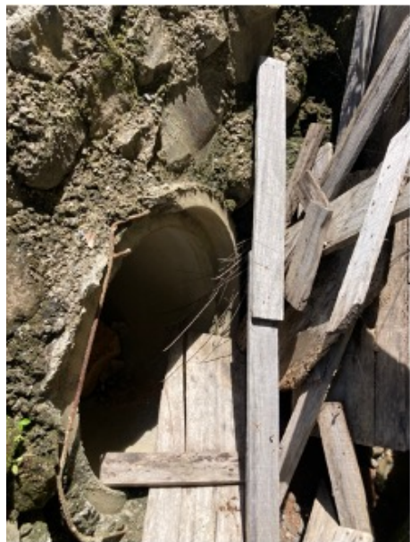
Appendix A Image 7: Entrance of culvert 1. Wooden debris from cliff ladder shown.