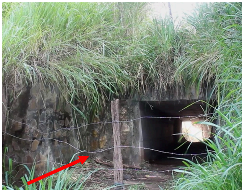
Appendix A Image 5: Fence at Tunnel 1 emphasized with red arrow.