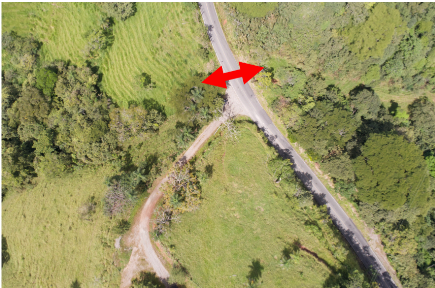
Appendix A Image 2: Aerial view of Tunnel 2. Underpass is indicated with an arrow.