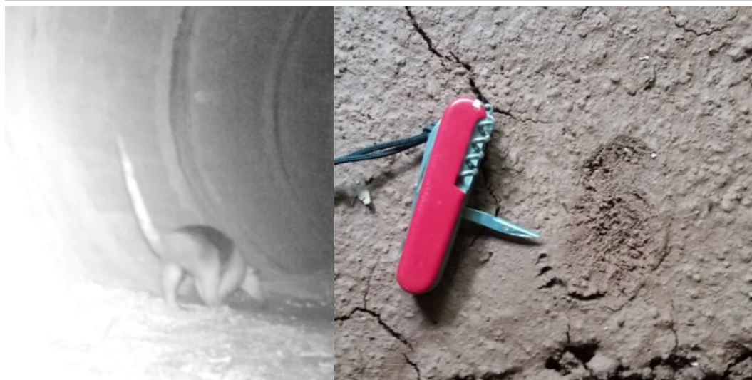
Appendix C Image 11: Tamandua ( Tamandua mexicana ) pictured in Tunnel 1