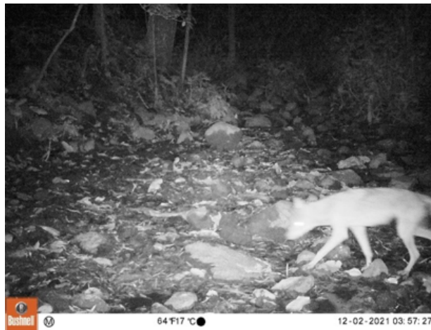
Appendix C Image 1: Coyote ( Canis latrans ) pictured in fragment