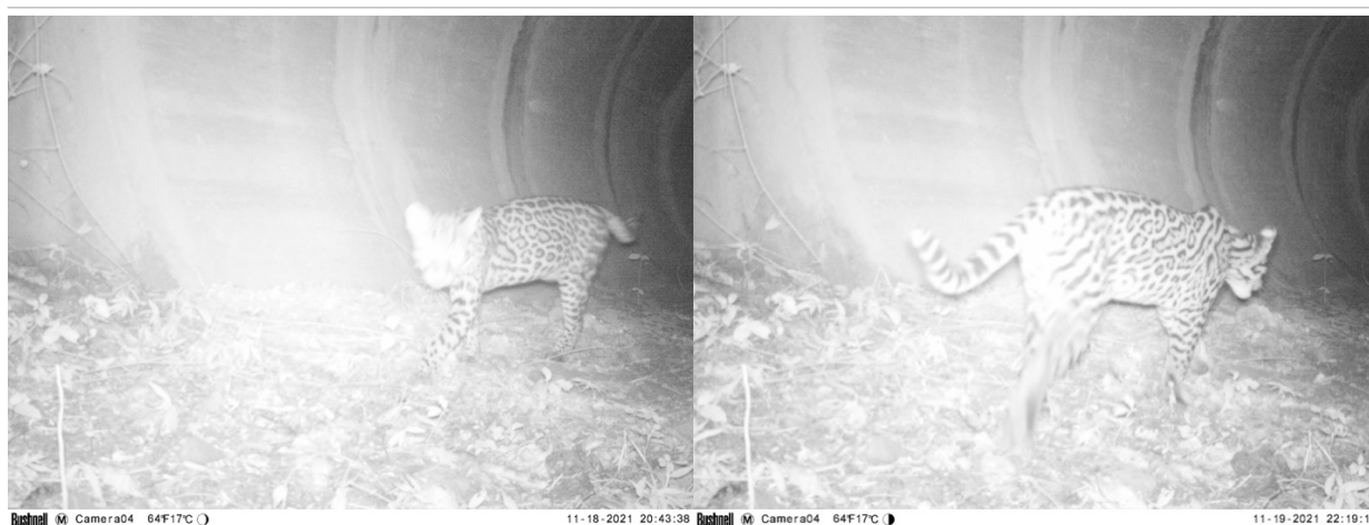
Appendix C Image 8: Ocelot ( Leopardus pardalis ) pictured in Tunnel 1