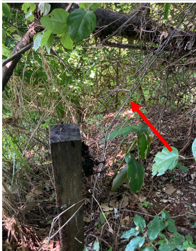
Appendix A Image 6: Fence at Tunnel 2 emphasized with red arrow.