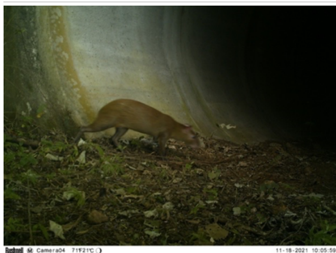
Appendix C Image 4: Agouti ( Dasyprocta punctata ) pictured in Tunnel 1