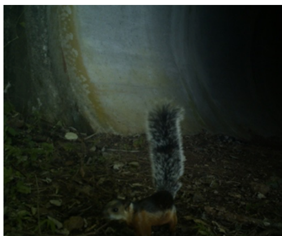
Appendix C Image 10: Squirrel ( Sciurus variegatoides ) pictured in Tunnel 1