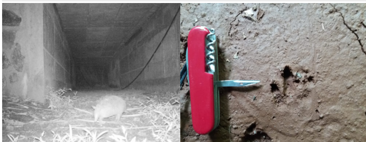
Appendix C Image 5: Nine-Banded Armadillo ( Dasypus novemcinctus ) pictured in Tunnel 2