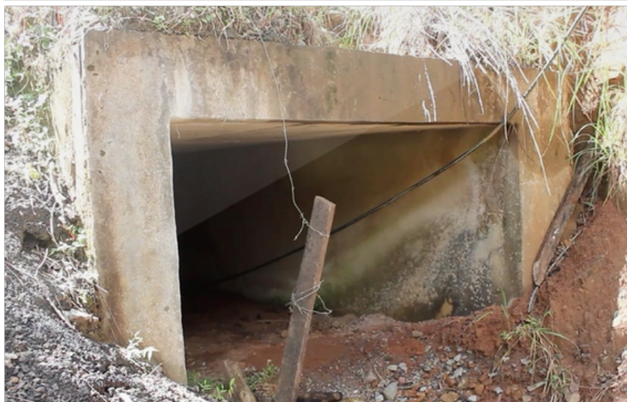
Appendix A Image 4: Entrance of Tunnel 2.