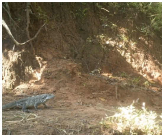
Appendix C Image 3: Black Iguana ( Ctenosaura similis ) pictured in fragment