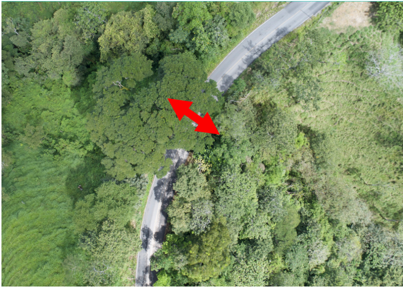
Appendix A Image 1: Aerial view of Tunnel 1. Underpass is indicated with an arrow. Photo taken by Randy Chinchilla on 30 November 2021.