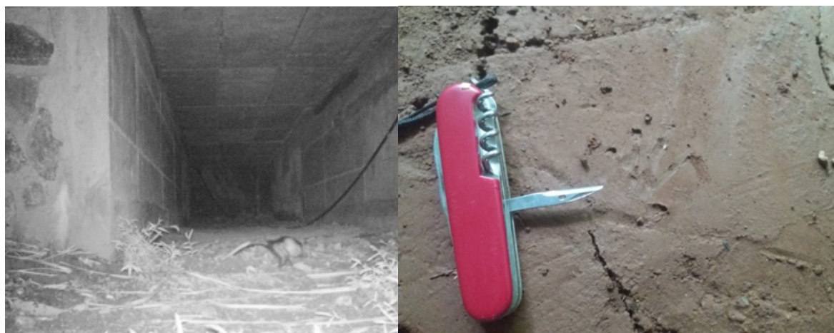
Appendix C Image 6: Common Opossum ( Didelphis marsupialis ) pictured in Tunnel 2