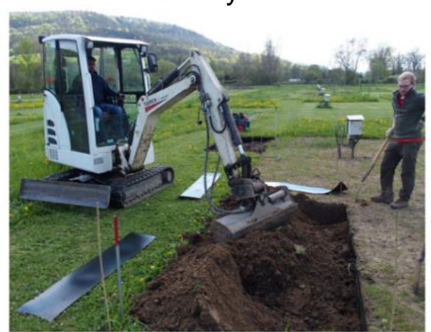
Established plots in June 2016