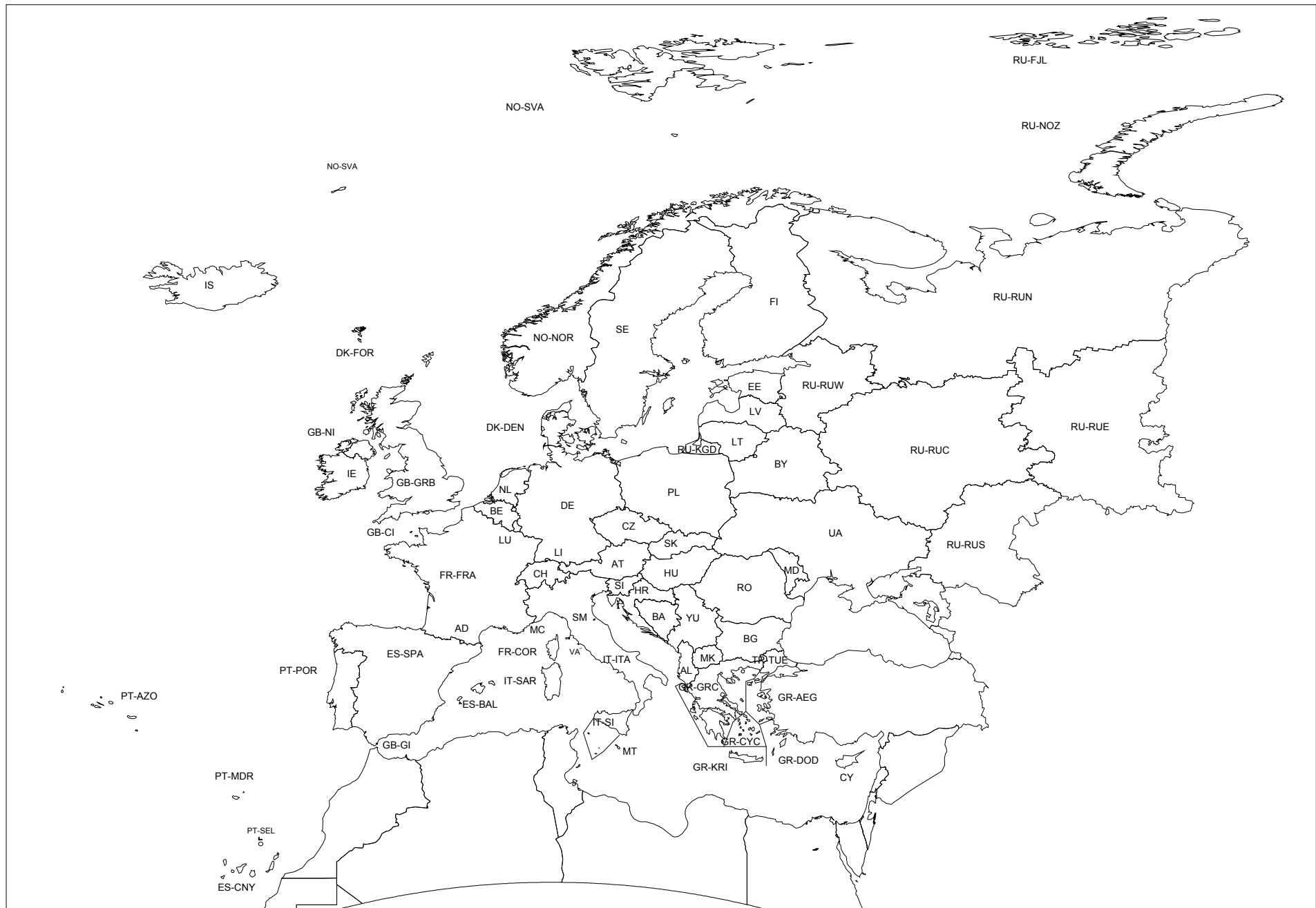
Map 1: Limits of Fauna Europaea and codes.