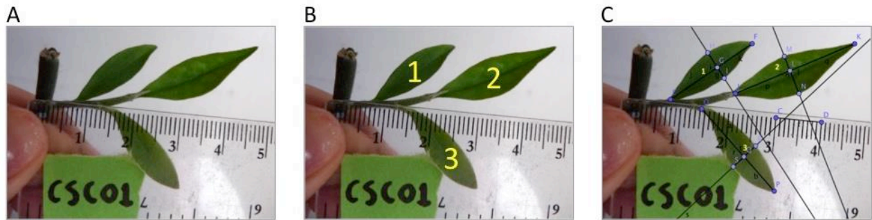
Supplementary file 2.1 A. Original image (with scale). B. All leaves were numbered and the largest leaves were selected for the measurements. C. Leaf maximum length, maximum width, and the distance from the base to the point of maximum width were measured in Geogebra Classic v.5.